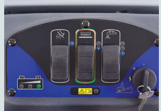
The SC750 ST / SC800 ST – provides simple operation and robust scrubbing controls.